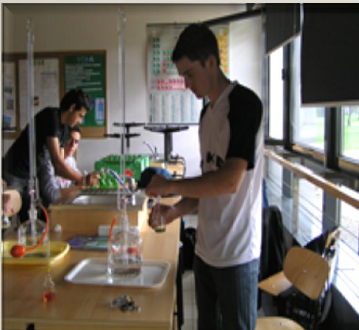
PIPETIRANJE S NaOH

Adding NaOH (Sodium Hydroxide) with a pipette