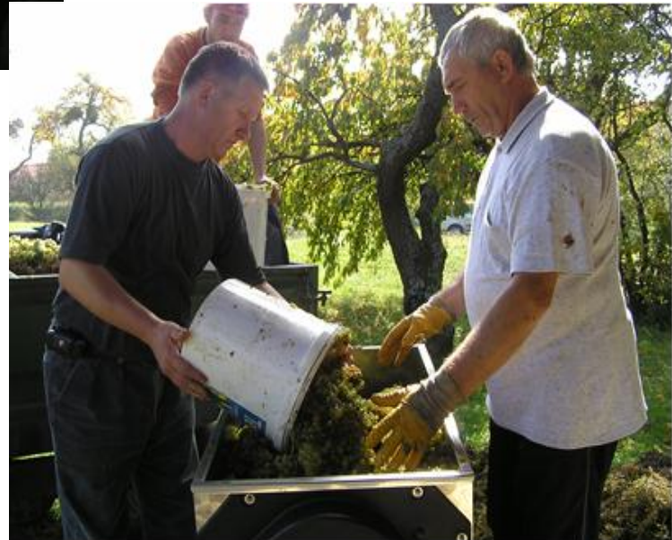
FILLING THE GRAPE DESTEMMER