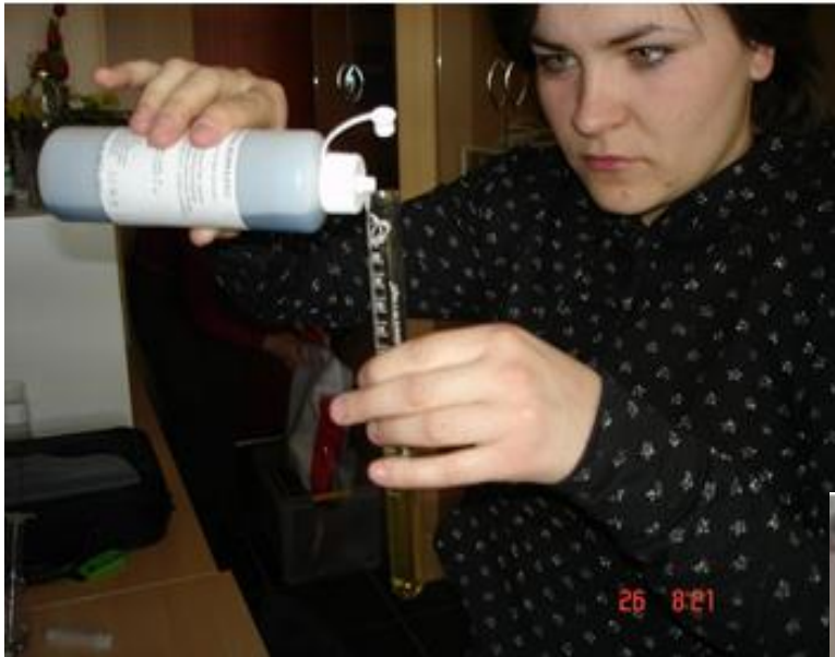
MEASURING FREE SULPHUR DIOXIDE