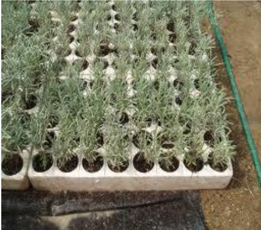
Rooted lavender cuttings